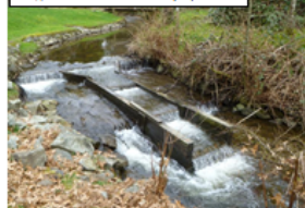
Eagle Fish Ladder removal project 2014